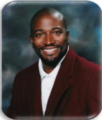
Quote of the Week

The following is a message from the desk of the "Big Dog"